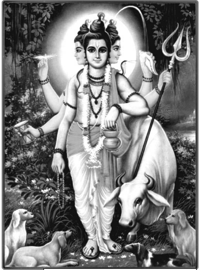
Shri Ādi Guru Dattātreya – an Incarnation of Vishnu, Shiva and Brahmā.

There was once a dutiful wife whose husband was, however, a licentious wretch. This couple unwittingly disturbed Rishi Mandavya, who had been placed on a spear by a misguided king. The Rishi, who was in agony but not dying, cursed them, saying that the husband would die at sunrise and the wife be left a widow. Widowhood is most abhorrent to a Hindu lady and considered worse than death. By the force of her intense loyalty to her husband she resisted the curse of the